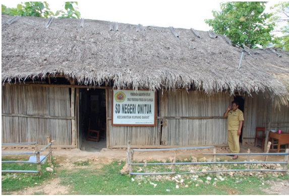
Primary school in Onitua (Kupang Barat)