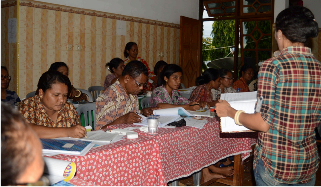
Library training in Flores, December 2017