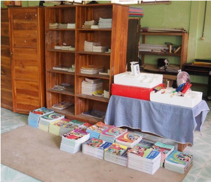
SDK 094 Tomu - Starting cataloguing and storage. Shelves, books catalogue boxes and library training are provided