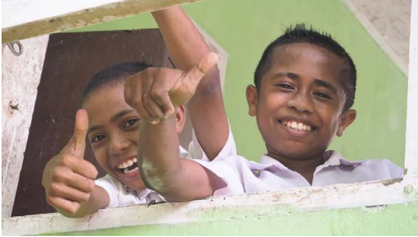
Students in Kewapante, Flores