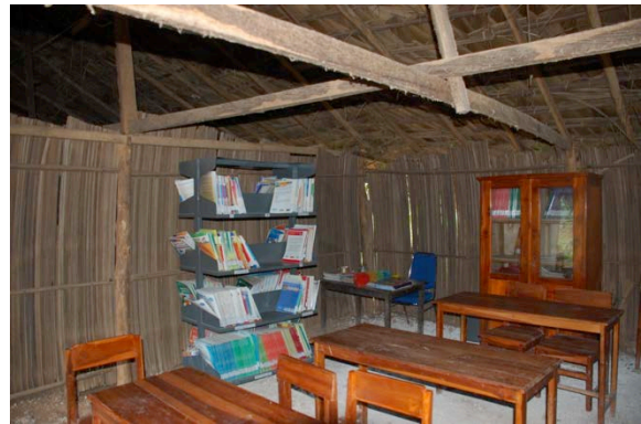
Classroom and Library in primary school Onitua