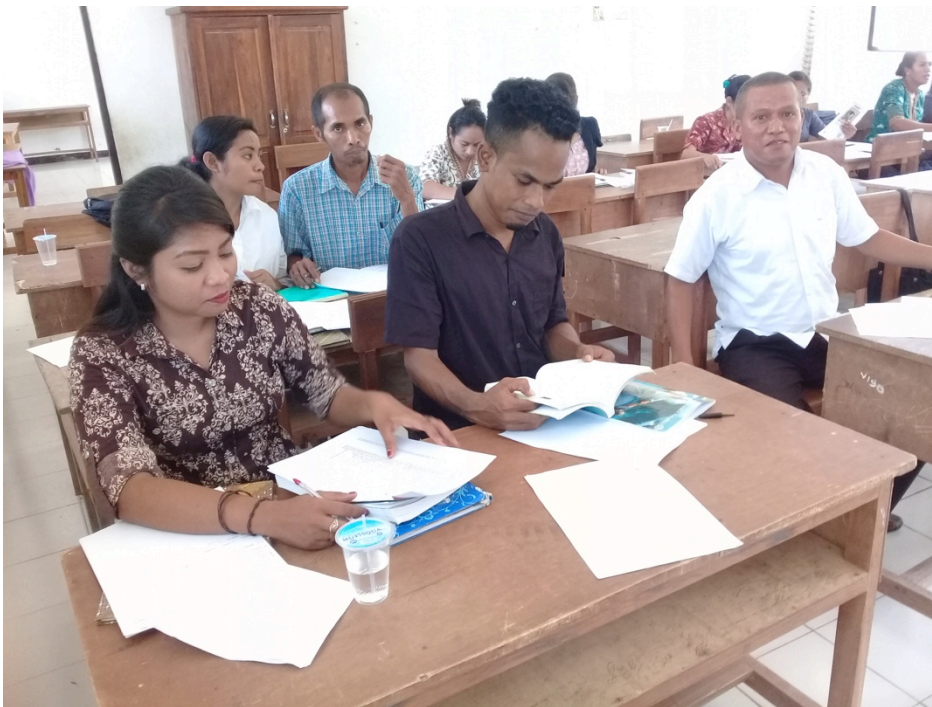
Library training in Semau, August 2017